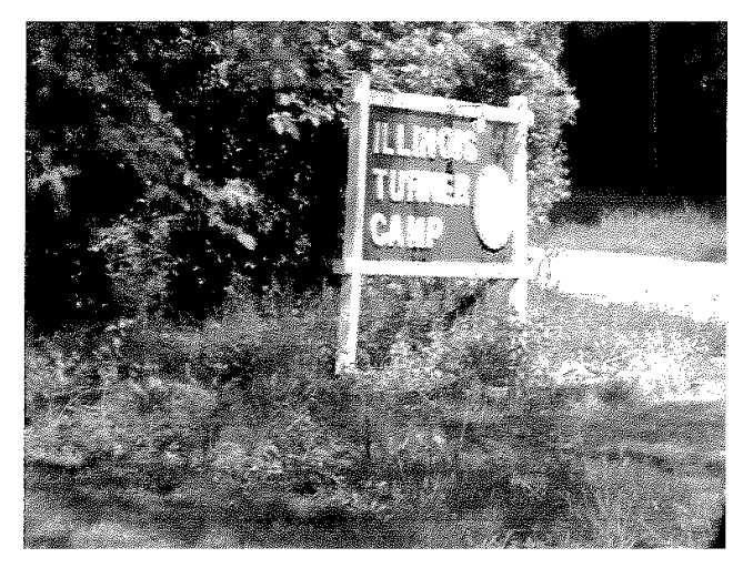
Over the years our land has increased and changed several times to reach a total of 102 acres, including 270 cabins, 3 volleyball courts, a basketball court, 3 tennis courts, a track, multiple fields for football, soccer and lacrosse, 1 softball diamond, a swimming pool with diving boards, and a shelter for gymnastics.